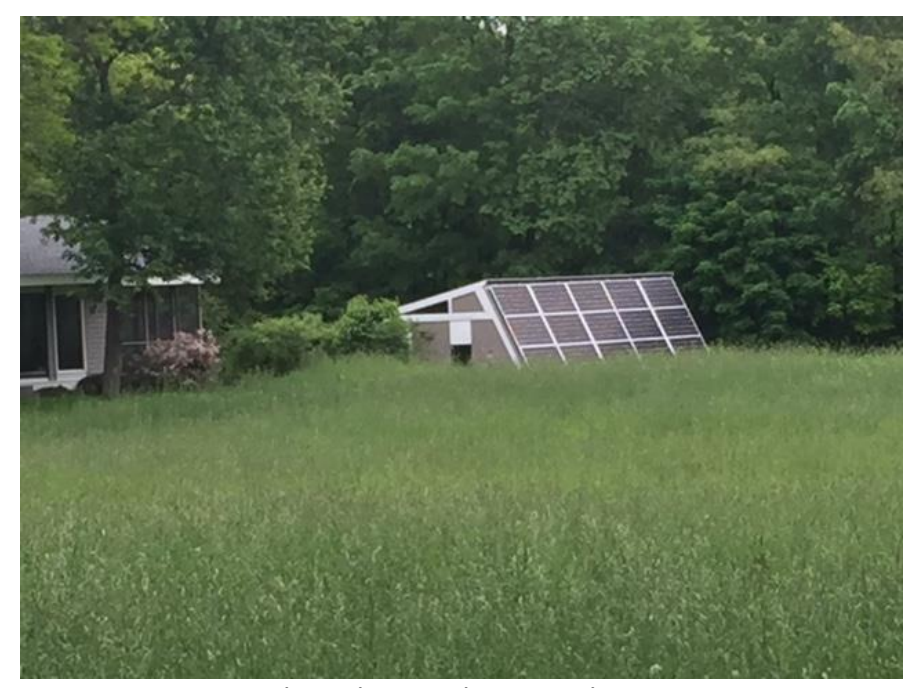
Residential Ground mounted system.