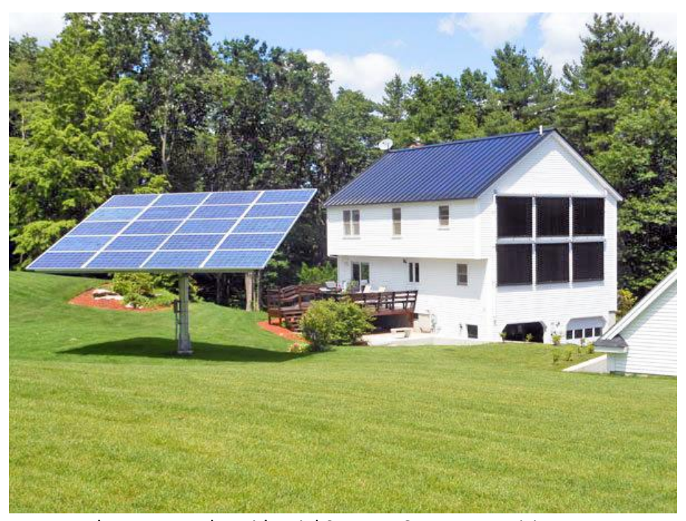
Tracker Mounted Residential System