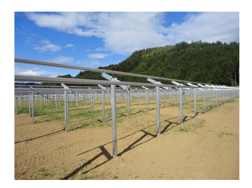
Racking equipment – prior to panel installation.