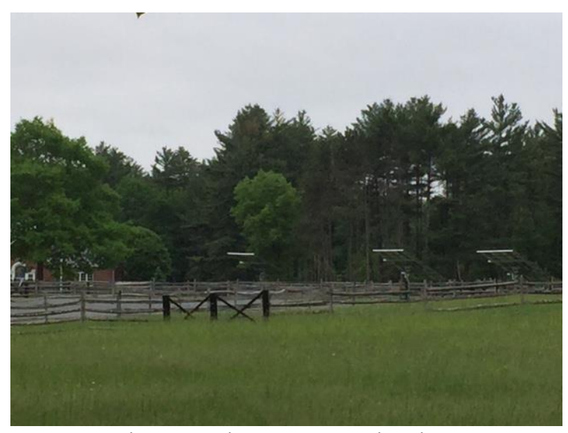
Pole mounted system – agricultural site.